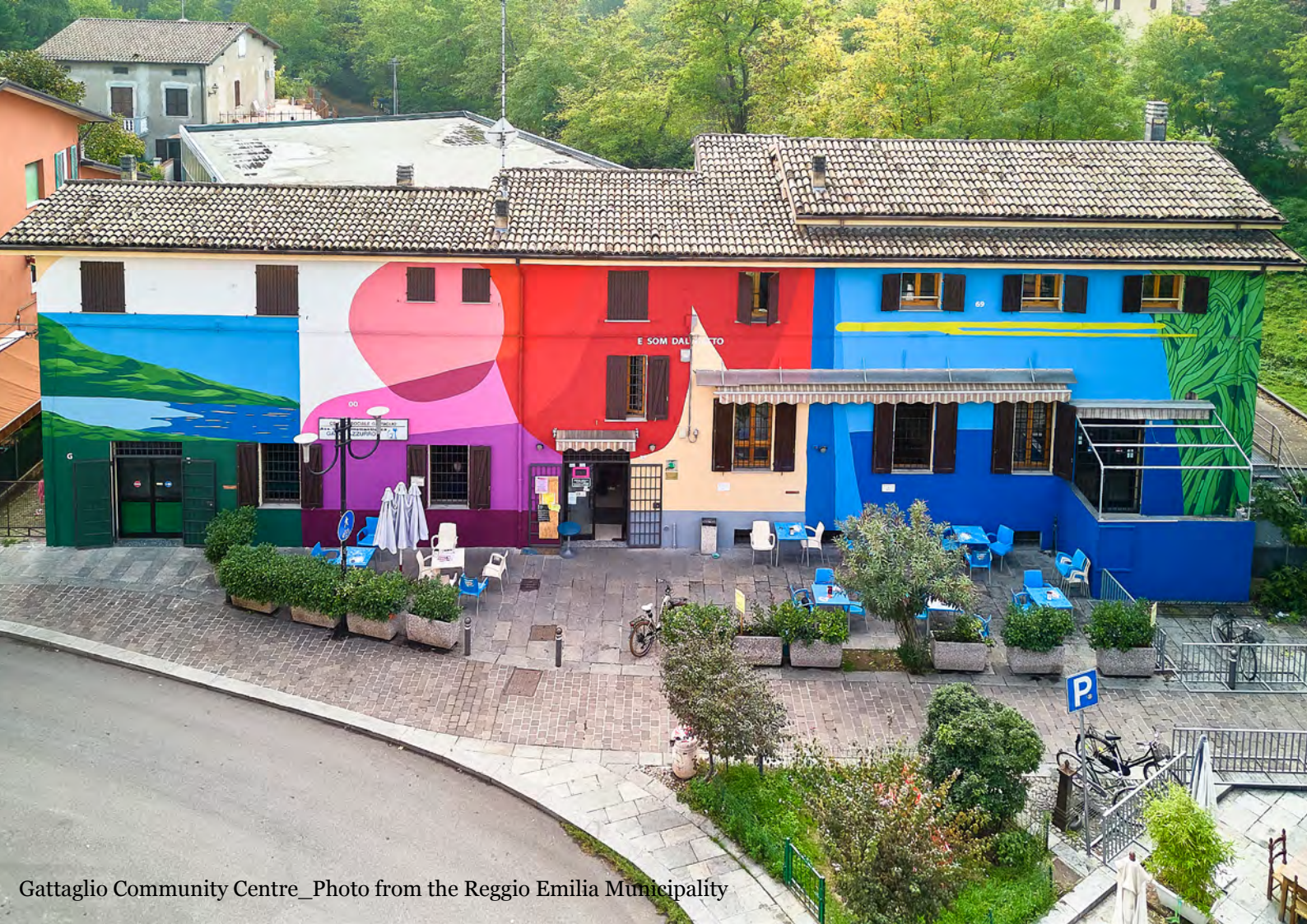
Gattaglio Community Centre