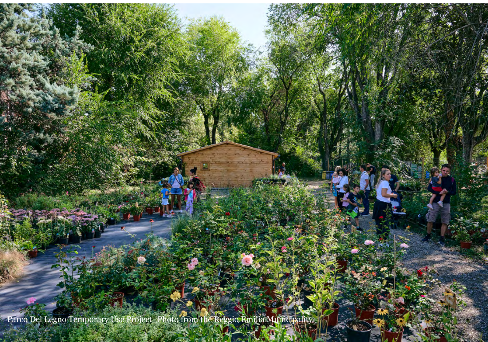
Parco Del Legno Temporary Use Project