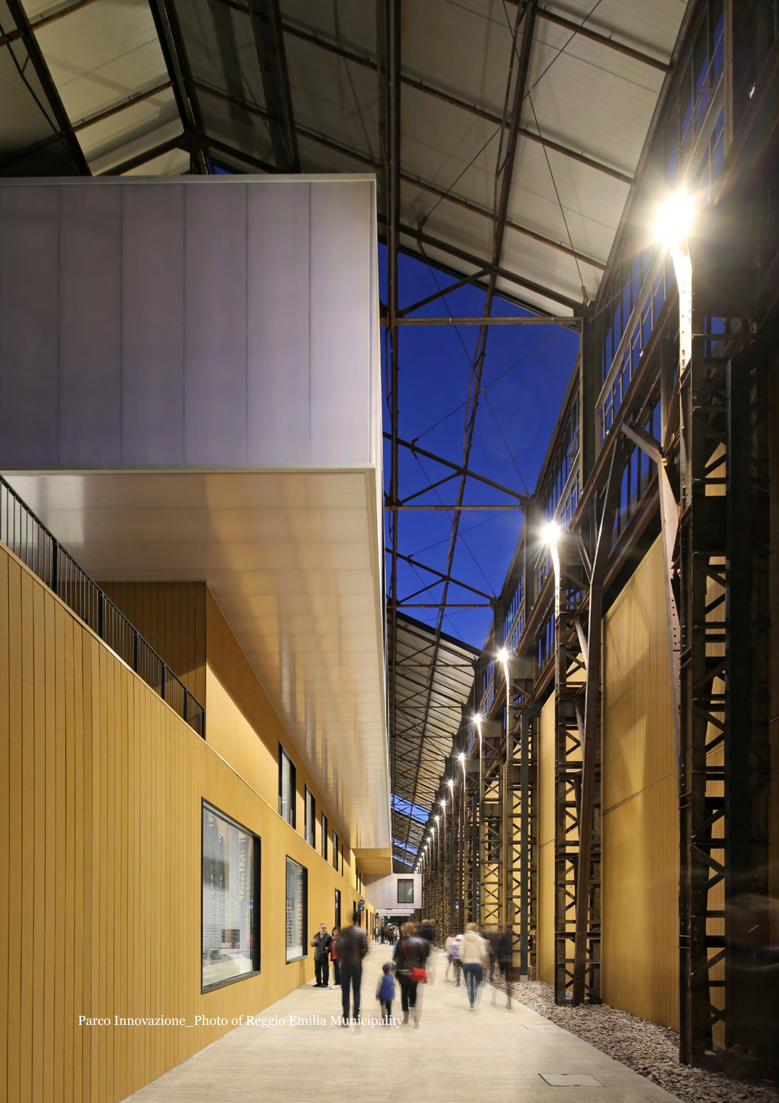
Parco Innovazione_Photo of Reggio Emilia Municipality