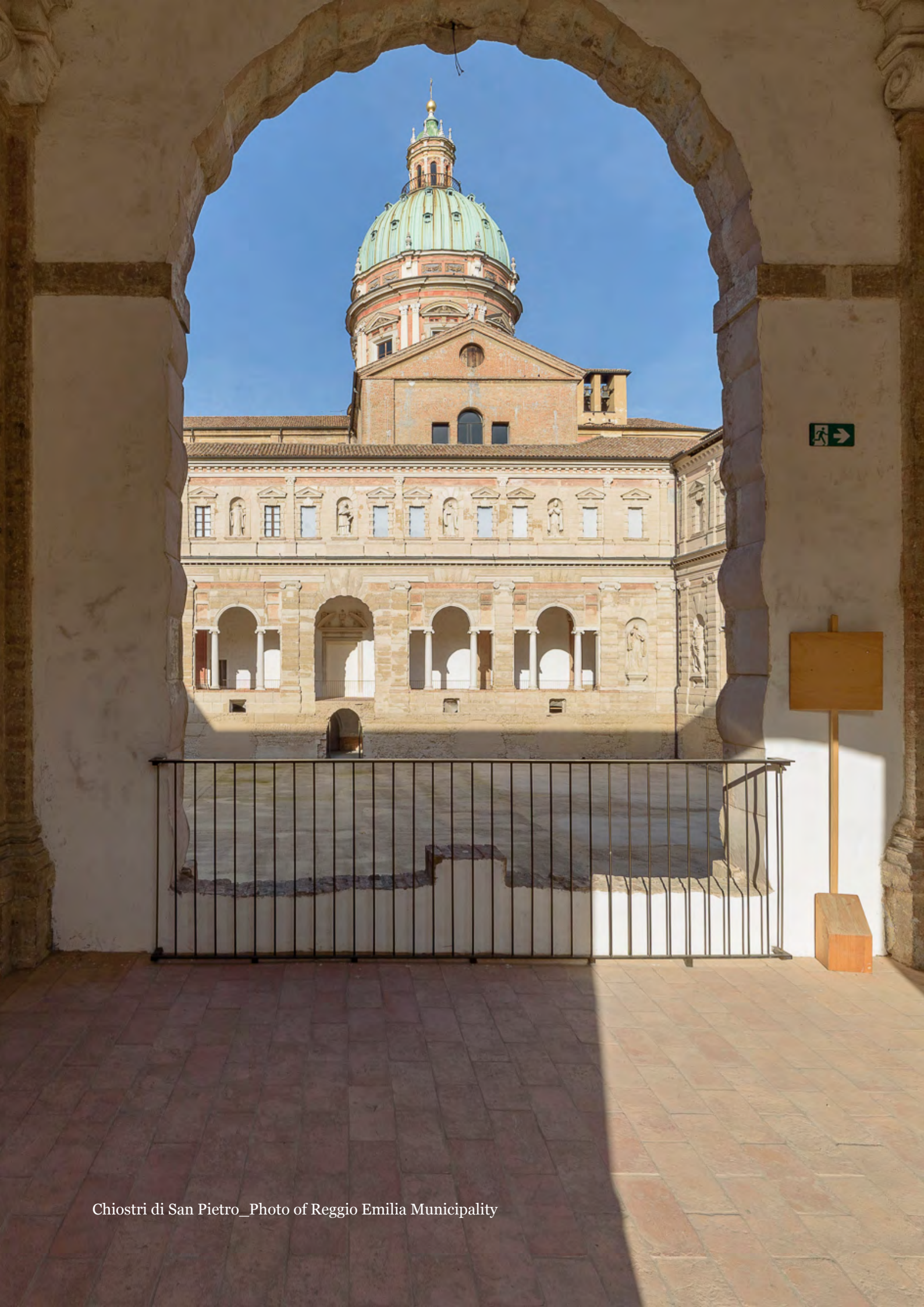
Chiostri di San Pietro