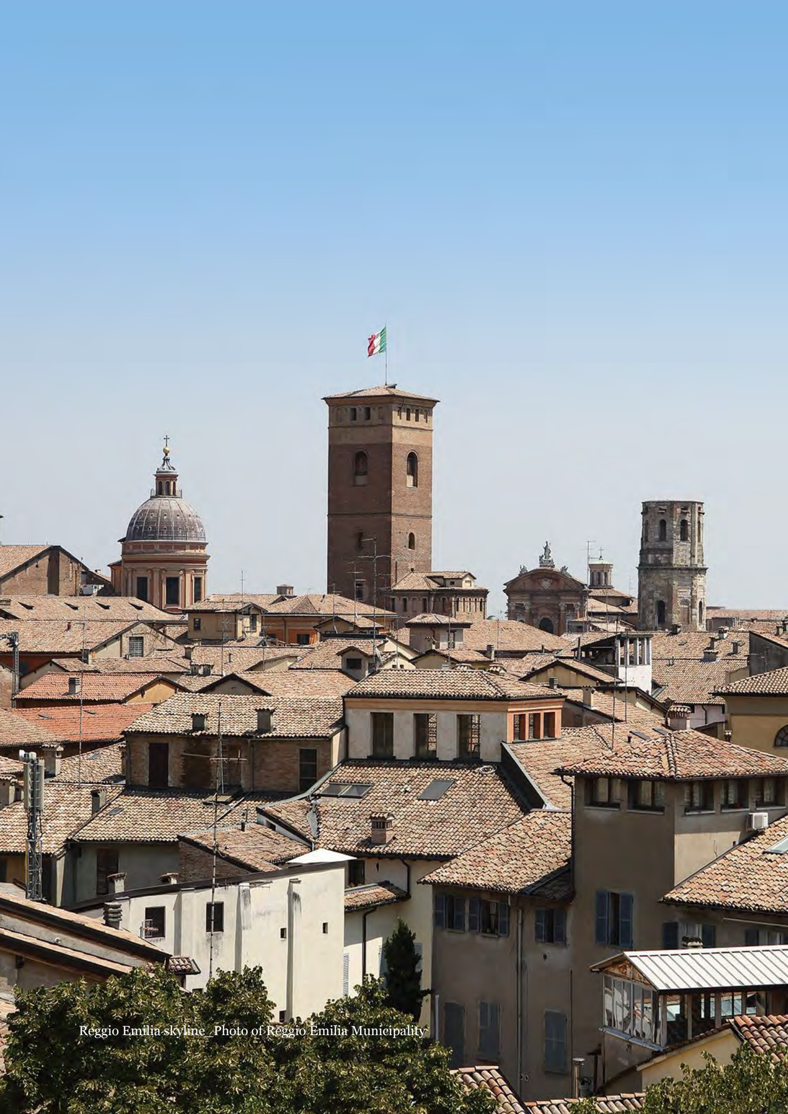
Reggio Emilia skyline _Photo of Reggio Emilia Municipality